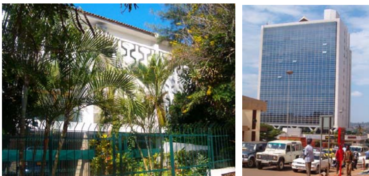
Fig. 4.3: The building on the left takes advantage of tree shade, the one to the right doesn't

The use of trees and other kinds of vegetation can go a long way in enhancing thermal comfort of buildings and building environments. Trees give good shade to buildings and protect them from the intense sun heat. However, in most of the cases studied, the use of trees for enhancing a pleasant micro climate in buildings was not considered. Figure 4.3 below shows examples of two building environments, one where vegetation is positively utilized and another where it is not utilized at all.