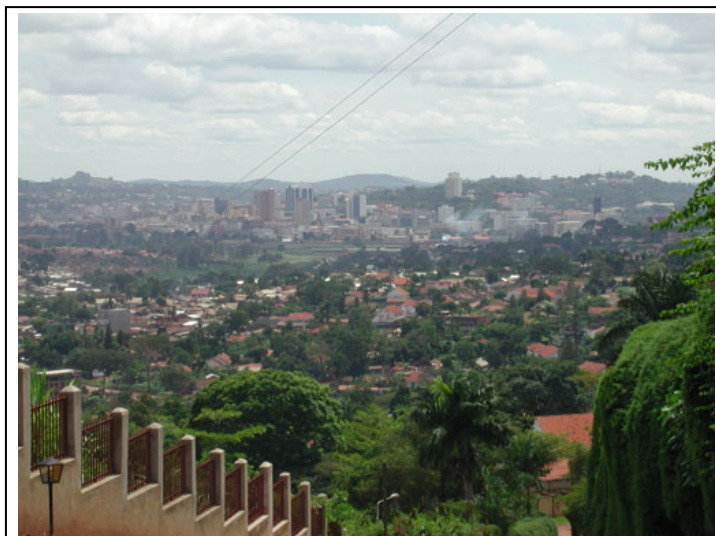
Fig 1.1: Part of Kampala showing the sprawling nature of the City.

Modern African Architecture is generally assumed to cover the period from the 1950s to present time. It is from the 50s that urban populations in Africa started rapid growth. With the coming of independence, the African countries embarked on programmes of industrialization and development of service sectors that inevitably pulled large numbers of rural inhabitants to the urban centres. The rapid increase in urban population required a corresponding response in expansion of housing and other built infrastructure, including institutional, commercial and industrial buildings. The growth rate implies that a growing number of people will depend on environmental goods and services for their survival thus putting increased pressure on the available natural resources (NEMA Report, 2002:08). The economies of the newly independent countries were too weak to cope with the new problem. Originally well planned cities deteriorated into largely informalised settlements. A good example is Kampala, where more than 70% of the population lives in unplanned, unhygienic informal settlements (Nnaggenda-Musana, 2006).