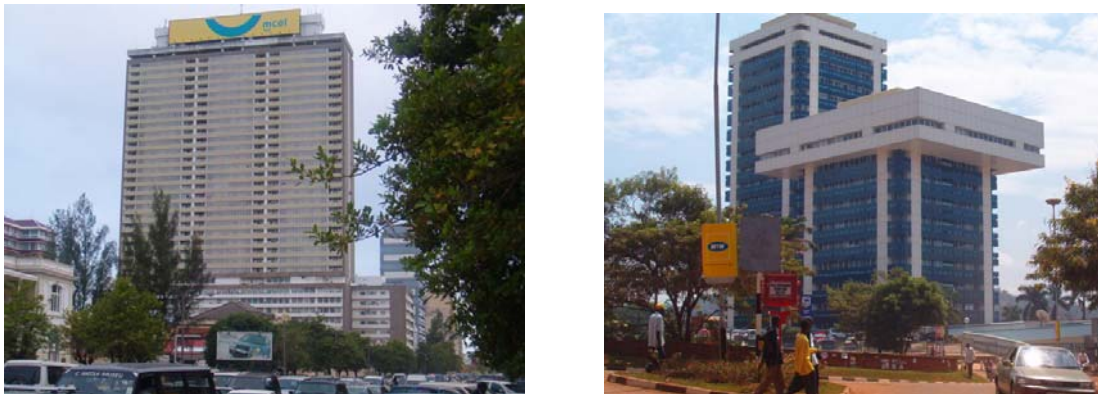
Fig. 4.2: The building on the left is well protected with sun-shading devices while the glass building on the right is not protected at all from direct sunlight.

Buildings that face east and west accumulate a lot of heat during the day and may require mechanical air conditioning to make them habitable. This is not sustainable given the acute lack of electricity in most African countries.