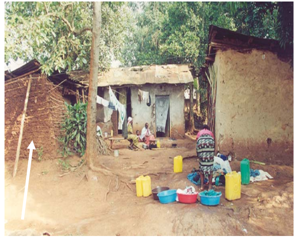
Fig. 1.2 A government housing project to the left Clearly shows the massive differences With unhygienic dwellings in informal Settlements to the right

This paper examines some of the architectural tendencies in the East African region, with particular emphasis on large housing estates and institutional buildings and their response to the environmental conditions of the region.